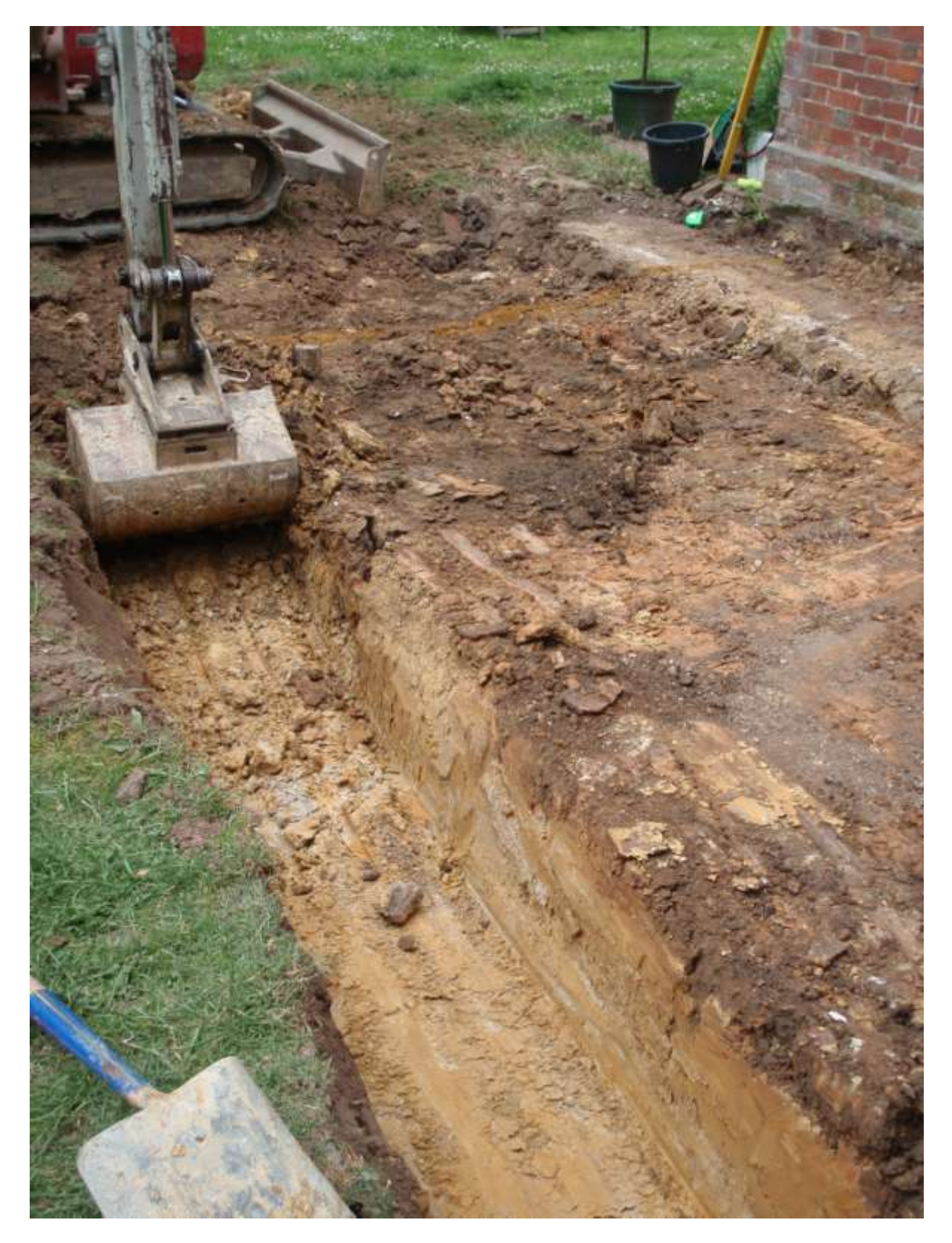
Plate 2. Phase 1, view of the site after part topsoil strip (looking west)