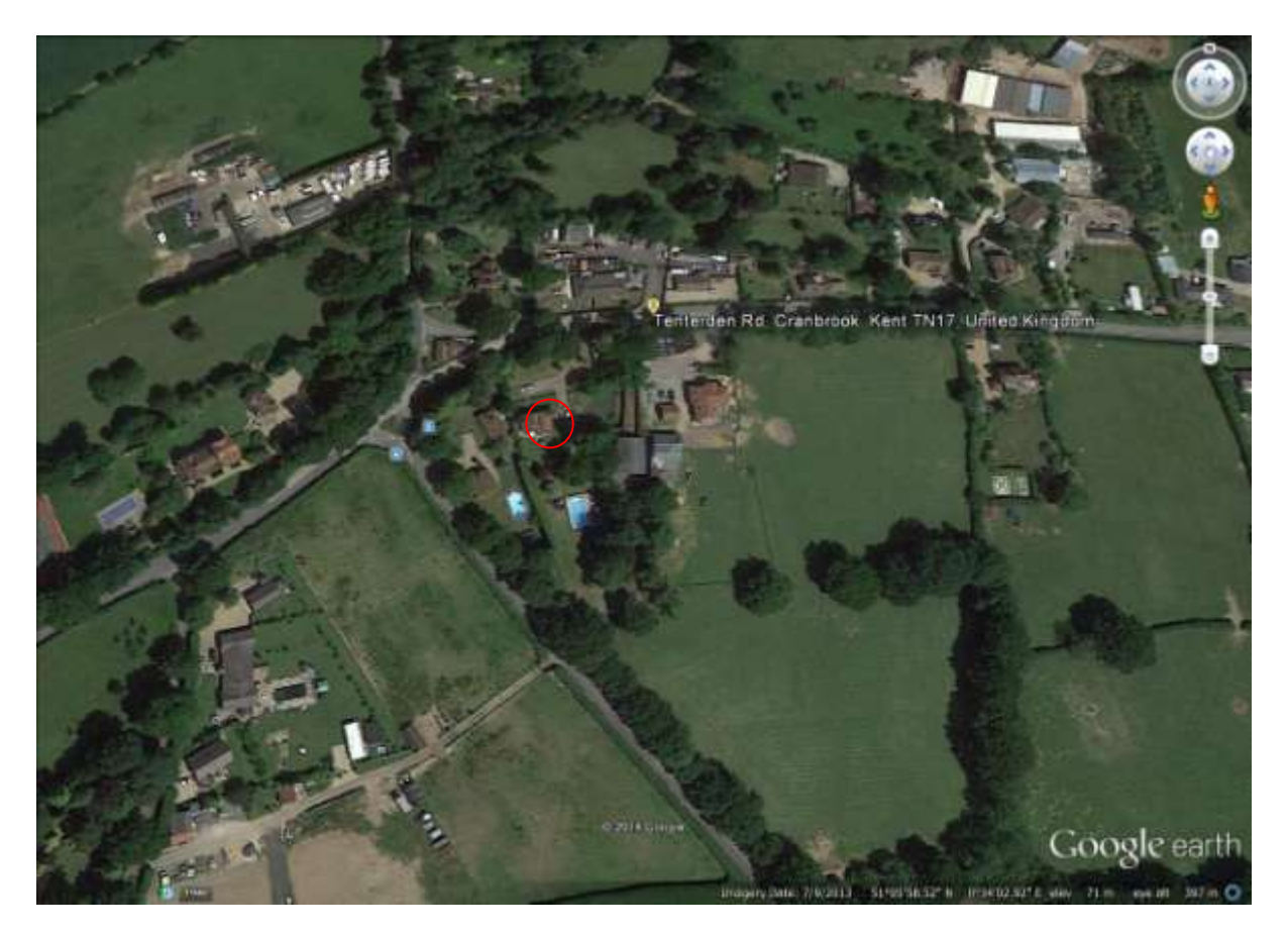
Plate 1. Aerial view showing the site prior to development.