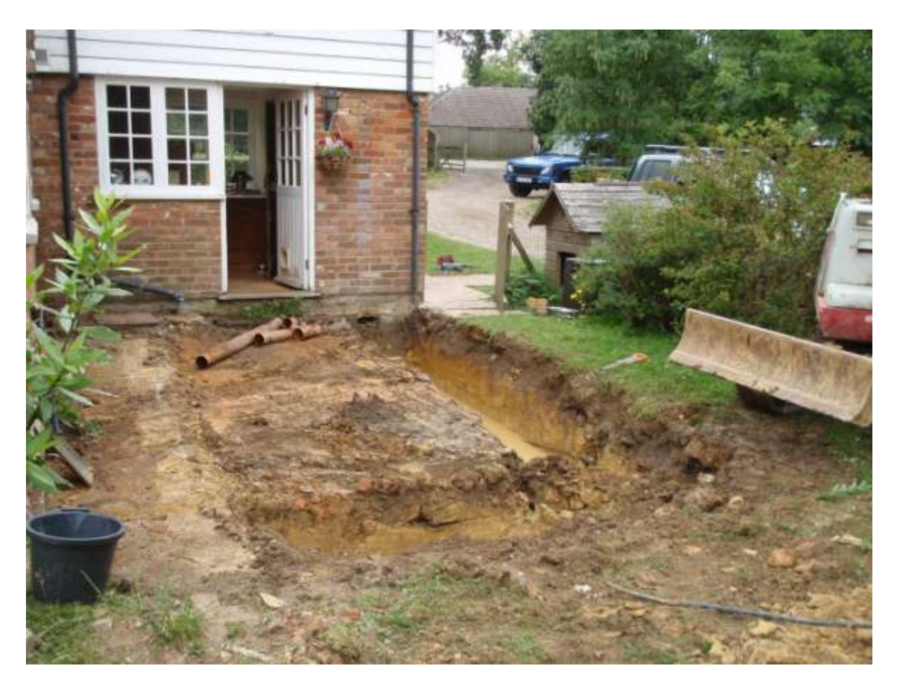
Plate 4. View of site showing site trenches (looking west)